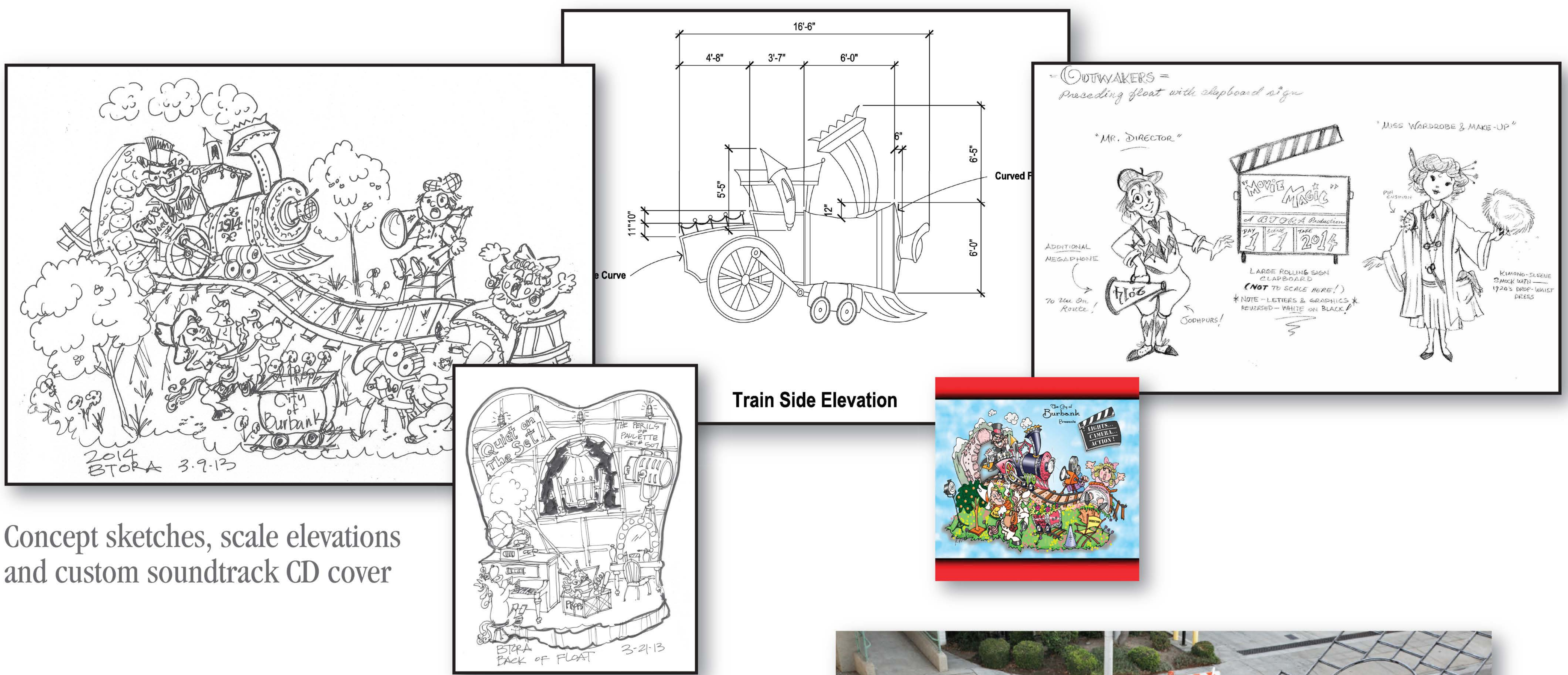
Concept sketches, scale elevations and custom soundtrack CD cover

The photos below document the design and building of the 2014 Rose Parade® self-built float Lights...Camera... Action! entered by the City of Burbank.