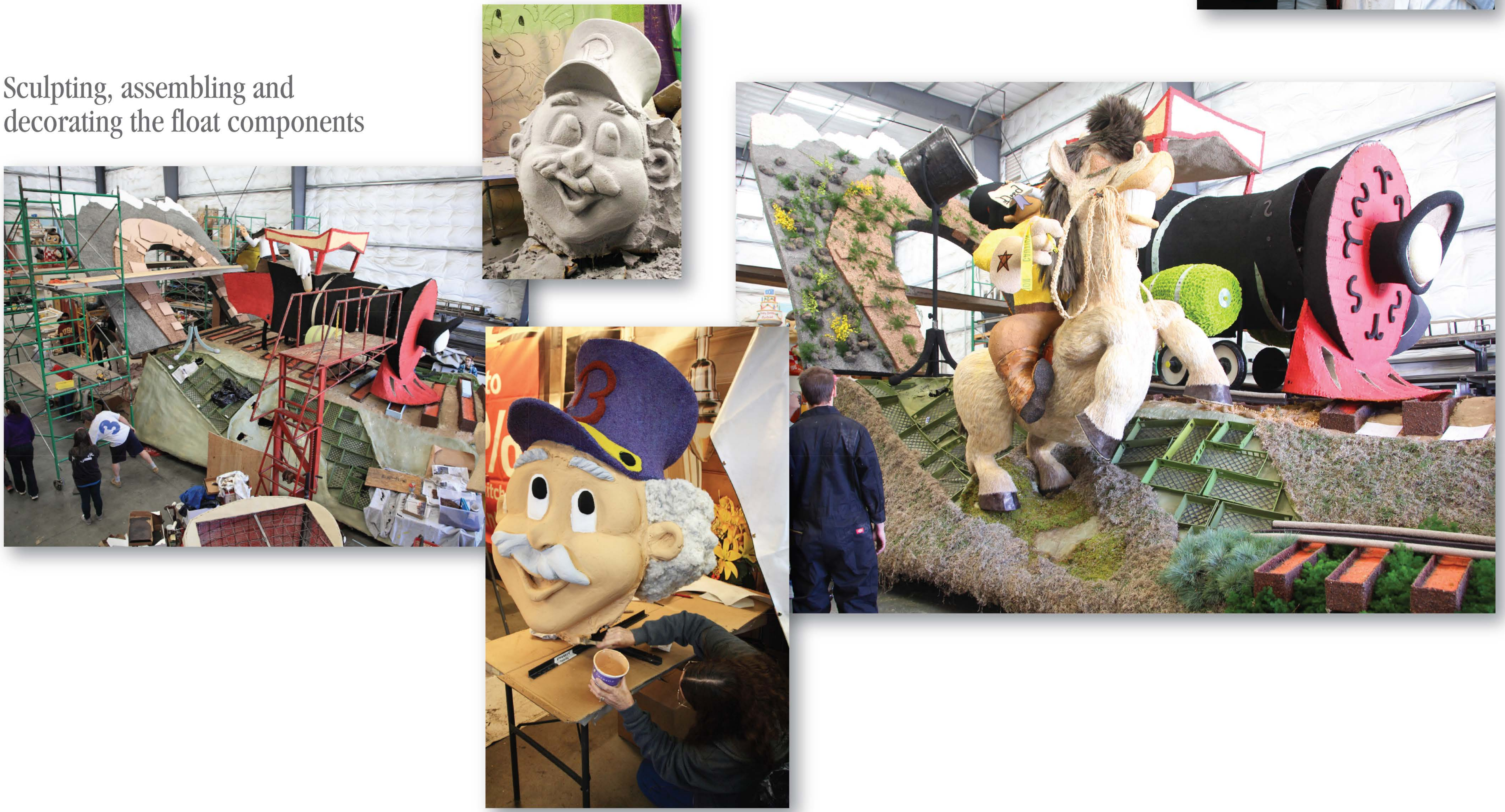
Sculpting, assembling and decorating the float components